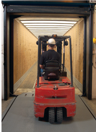
Gaps are sealed by GapMaster hooks, without restricting access to the trailer.