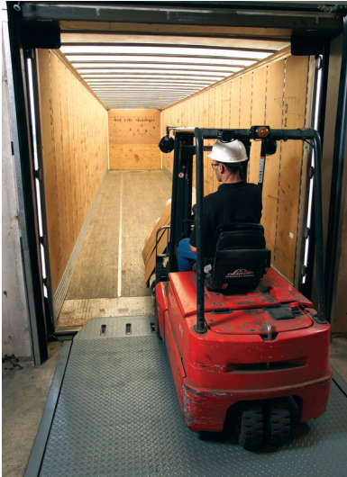
Ordinary shelter leaves trailer door hinge gaps exposed.