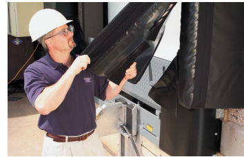
Removable side curtains.

Narrow 6"-wide (152 mm) side frames allow shelter to fit into narrow spaces, even at high projections. This can eliminate the need for expensive repositioning of lights, signs and electrical conduit. 11'2" (3404 mm) shelter footprint stays the same, regardless of projection.