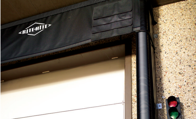
6"-wide (152 mm) side frames allow shelter to fit into narrow spaces.