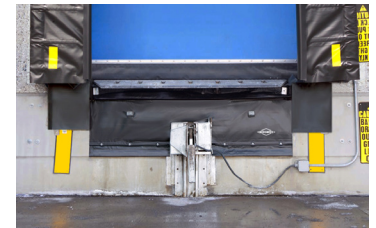
PitMaster Under-leveler Seal.

Or visit our website for more information on the full line of additional Rite-Hite solutions, including the PitMaster™ Under-leveler Seal. PitMaster components help keep facilities cleaner and dramatically reduce energy loss at the dock.