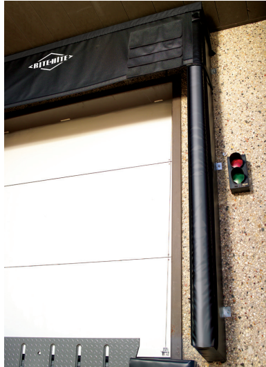
6"-wide (152 mm) side frames allow shelter to fit into narrow spaces.