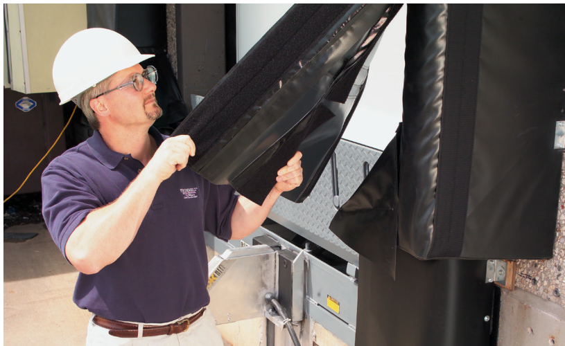
Removable side curtains allow for maintenance flexibility.