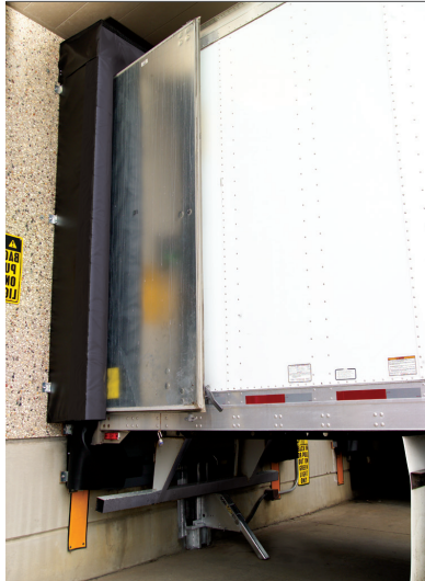
Eliminator side frames are impactable for long-term durability.