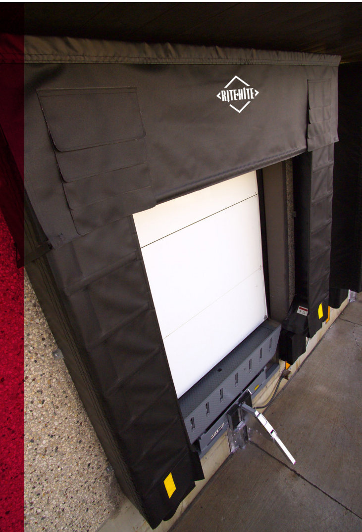
Rite-Hite® Eliminator Dock Shelter.