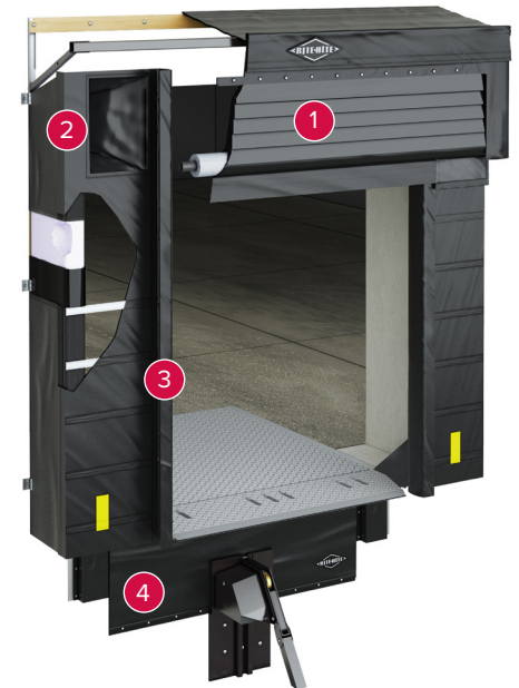
Rite-Hite ® Eclipse Dock Shelter shown with PitMaster Under-leveler Seal.

Gaps large and small beneath and around the dock leveler are sealed with optional PitMaster components, providing substantial energy savings, and improving cleanliness and sanitation.